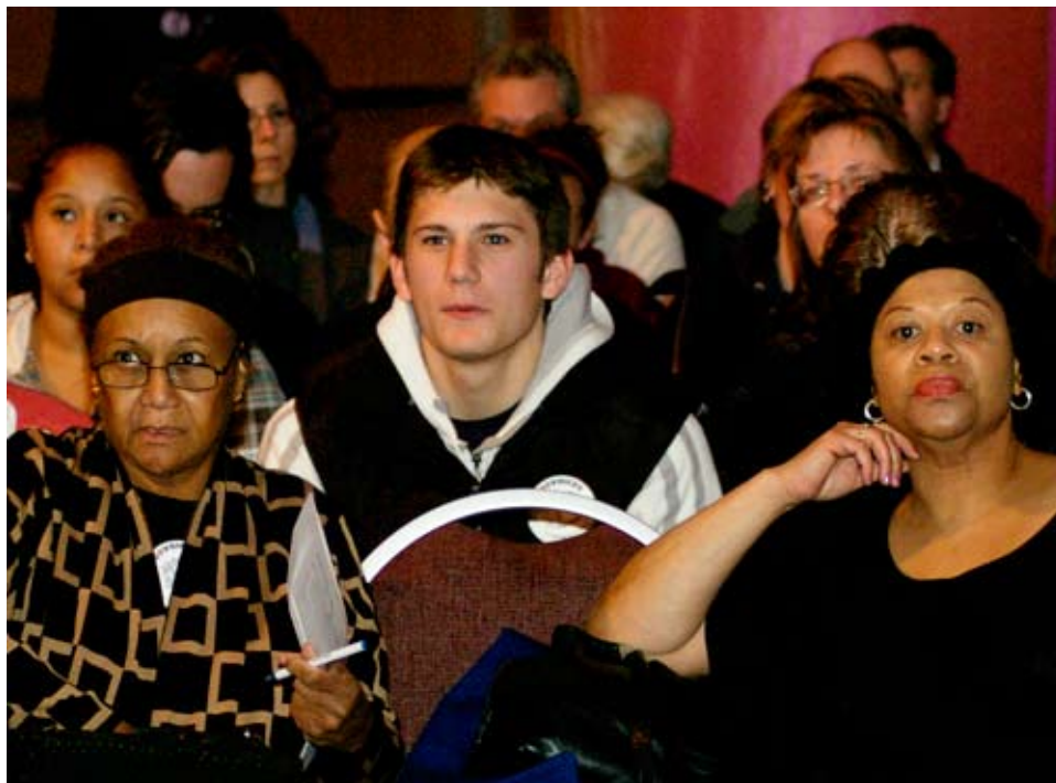
Participants in Shining the Light, December 5, 2010.