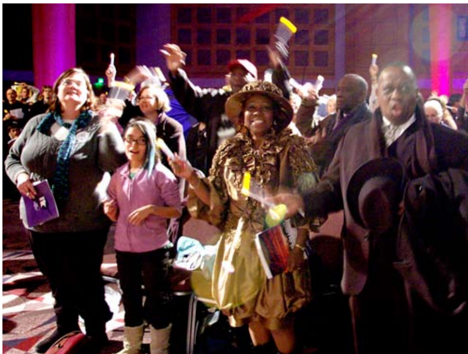
Participants in Shining the Light, December 5, 2010.