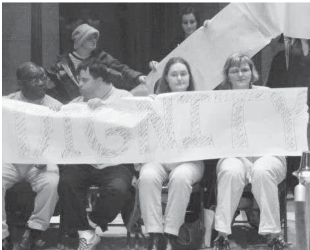
Self-Advocates from Central Minnesota at state Capital rally.

Since 1994, Advocating Change Together (ACT) restored or partially restored nine state hospital cemeteries where people with disabilities were buried and identified only by a number. Working with diverse groups in each community, such as the Ladies Auxiliary, Power Up Club, Alliance for the Mentally Ill, Arc Chapters, Disability Law Center, and People First Groups, as well as residents, family members, churches and grounds crews, ACT’s Remembering with Dignity project has replaced 5,629 numbered graves, 2,000 over the past five years, with markers bearing the deceased person’s name, date of birth, and date of death. ACT has secured legislative appropriations, most recently $135,000 , to cover direct costs of cemetery restorations. ACT plans to continue its efforts until all 13,000 numbered or unmarked graves are marked properly. Additionally, ACT gained $134,000 via a legislative appropriation and $100,000 via a publicly funded grant annually to distribute across six regions of Minnesota to organize people with disabilities through