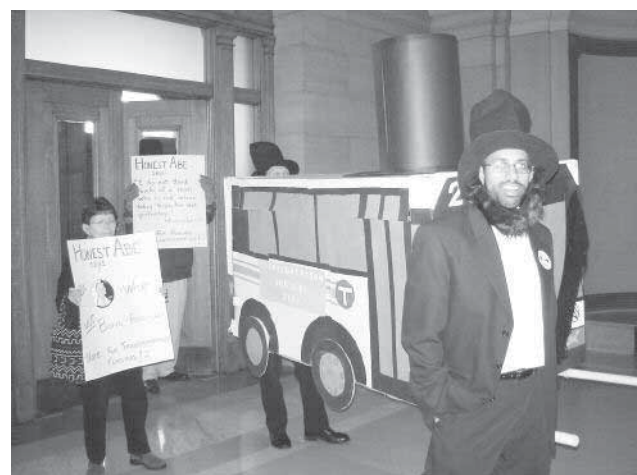
Members of the Transit Partners coalition dressed up as Abe Lincoln to remind legislators that passing comprehensive transportation reform in Minnesota was the honest thing to do.