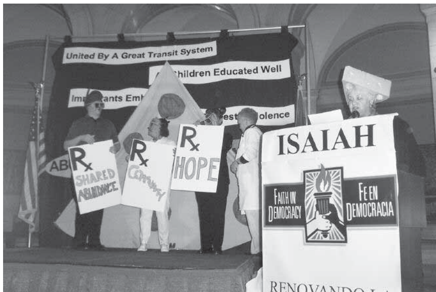
Some 150 ISAIAH leaders met to remind state lawmakers of their vision, and brought a ‘Boost of Courage’ to the Capitol. Their efforts included a comedic dramatization of the situation at the Capitol, featuring three blind mice and a big cheese.

ISAIAH uses a community organizing methodology in a faith-based context to work on issues of racial and economic justice. With 100 member congregations in the growth corridor of Minnesota, the group aims for impact at the state legislature as well as at the regional level. The methodology derives from the Alinsky family tree, but ISAIAH has evolved and innovated. For example, in the beginning ISAIAH worked at the neighborhood level on issues like stop signs and hot spots. Recognizing the limitations for change and wanting to affect the root causes of racial and economic disparities, ISAIAH began to work out of a metropolitan analysis. It expanded to the suburbs and began to work on campaigns around inclusionary housing, transportation and education. Building a larger