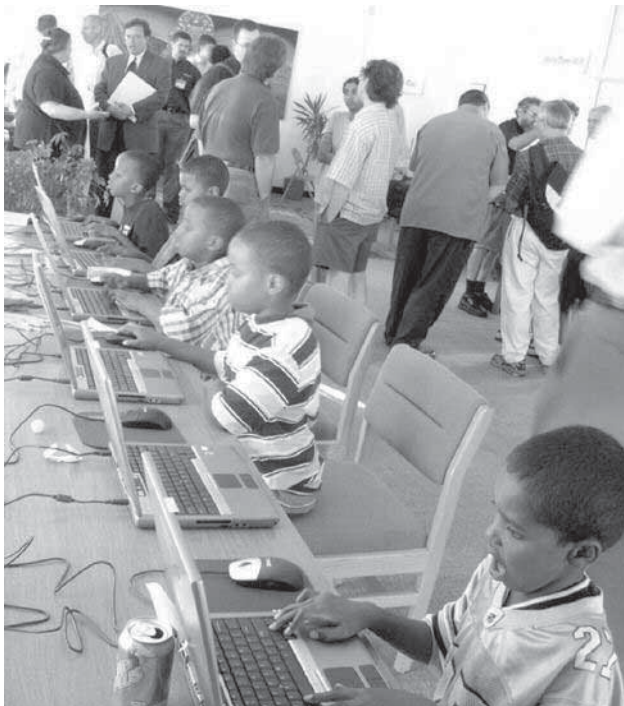
Kids using the laptops at the Brian Coyle Center Wi-Fi pilot project launch event.

Metropolitan Stability to lead an advocacy campaign centered on digital access for all residents of Minneapolis. Using a Community Benefits Agreement (CBA) model, the Alliance secured a binding WiFi vendor agreement that will steer millions of dollars toward addressing community technology needs and closing the digital divide in lower-income communities of color.