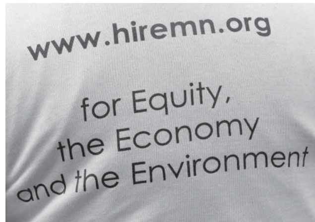
HIRE Minnesota encourages community members and elected officials to see the link between equity, the economy, and the environment.

Approximately 25,000 to 35,000 migrant workers come to Minnesota each year for the agricultural season. In 2004, Centro Campesino began organizing approximately 750 migrant workers at Lake Side Foods in Owatonna and Seneca Foods in Montgomery, communities in southern Minnesota. Group leaders met with workers one-on-one and created a new union structure called UTN (United Workers of the North), the first union for seasonal workers in the Midwest . They collected union cards, called for union elections, demonstrated for days in front of the companies’ facilities and garnered media attention. Though workers did not win the election, they received collateral ben-