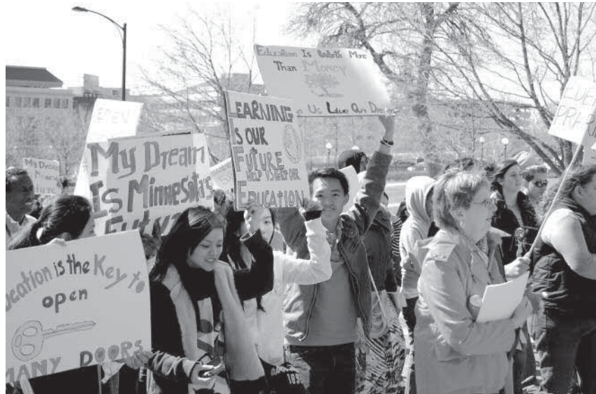
Youth and their allies march to the state house during Student Day at the Capitol, organized annually by the Minnesota Immigrant Freedom Network.

The state provides the bulk of public education funding in Minnesota, which has been stagnant for years because of strict adherence to a “no new taxes” policy. ISAIAH forged a partnership with the education establishment, including teachers' unions and other labor groups, superintendents, school associations and parents to create a broader grassroots campaign that led to a $480 million increase in school funding over two years. These funds will benefit the state's more than 822,000 public school students . Notably, the coalition defeated efforts to decrease the formula that gives greater aid to schools with lower-income students. It also protected other vulnerable citizens by insisting