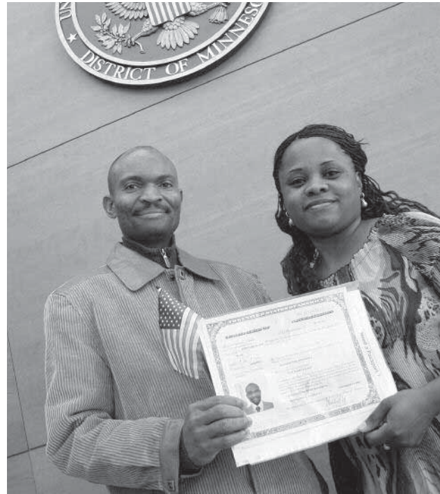
A client of the Immigrant Law Center for Minnesota on the day he was sworn in as a new U.S. citizen.

In 2004, Centro Campesino helped 13 families in Montgomery that were being displaced and evicted by the city. City officials claimed they were selling the building to encourage downtown redevelopment and reduce housing density. However, the tenants and their advocates believed the city was attempting to remove immigrants from the downtown area altogether. The group organized local leaders from the affected fami-