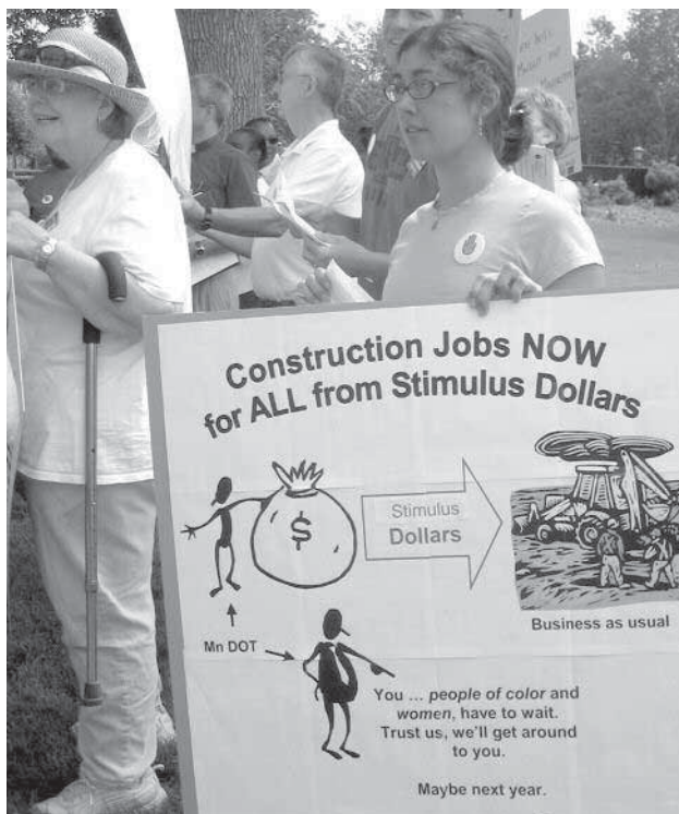
A diverse crowd joined together to let the Minnesota Department of Transportation know that their failure to meet hiring goals was no longer acceptable.

Working with more than 70 organizations through the HIRE Minnesota Coalition, 38 the Alliance for Metropolitan Stability helped secure $2 million in federal funds in 2009 to train low-income individuals for green jobs using money from the American Recovery and Reinvestment Act of 2009, and $500,000 to do community outreach around energy efficiency. Consequently, up to 2,000 jobs will be created; hundreds of low-income people will receive green jobs training, and thousands of Minnesotans will receive energy efficiency education through community outreach. Further, as a result of the coalition's advocacy, state agencies that administer the funds must present