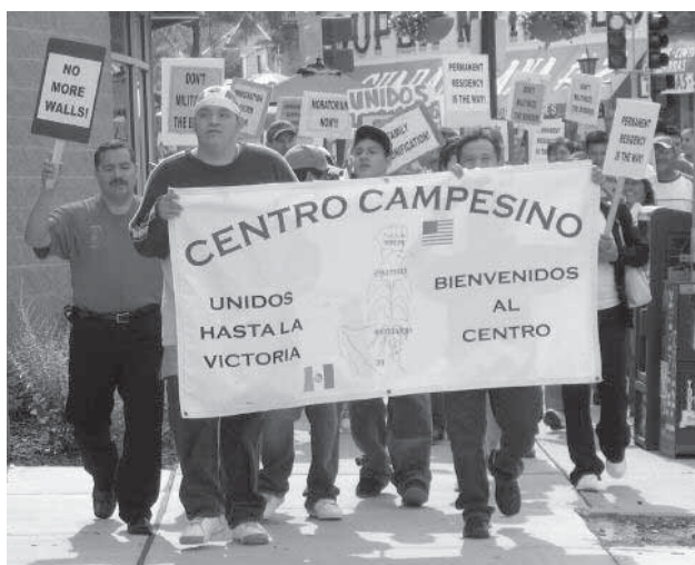
A march in 2006 in favor of fair and just immigration reform.