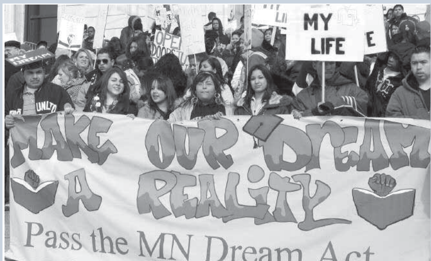
Students advocate for the DREAM ACT during the 2008 Student Day at the Capitol. They are members of the Centro Campesino's Youth Organizing Committee from Waseca, Owatonna and Northfield.

expand their youth leadership development program, build community unity, and elevate the voices of immigrants in the public arena.